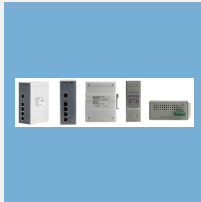
Ethernet Switch PLC Based System