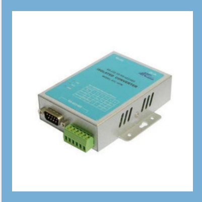
ATC-107N Wall Mounted Isolation Interface Converter