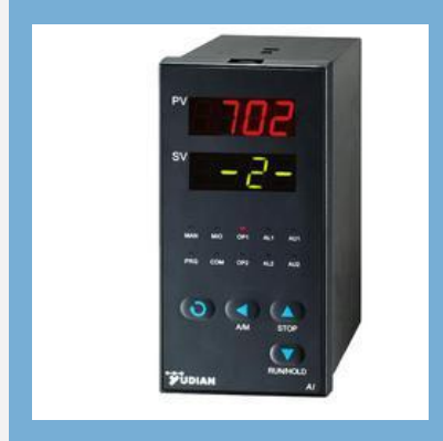
Multi Channel Scanner AI-702