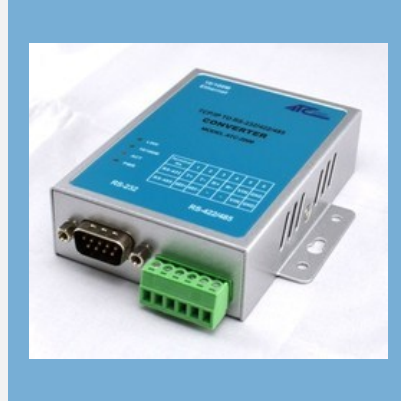
ATC 2000 IP Converter