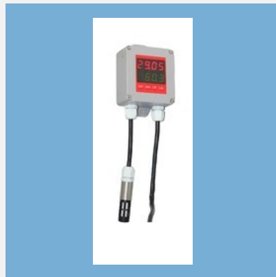
THT-102 Temperature and Humidity Transmitter