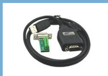
ATC-840 USB To RS-422 Converter