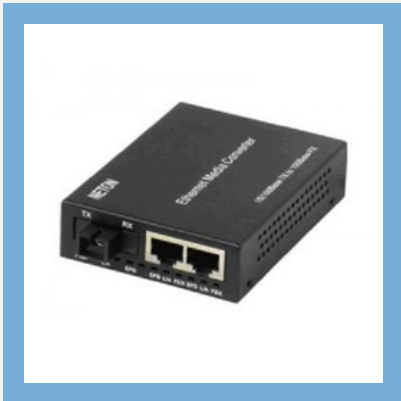
NMC-3301 Fibre Optic to Ethernet Converter