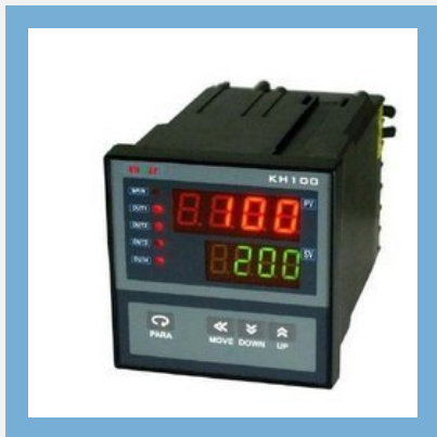
Barcode Scanner Channel Indicator