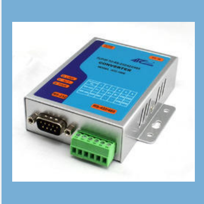
ATC-1000 Serial To TCP/IP Ethernet Converter