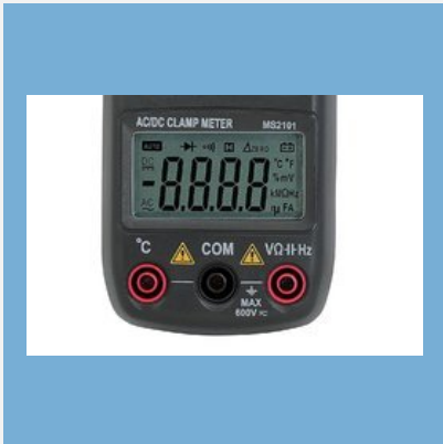
MTECH FG8 Series Frequency Digital Meter