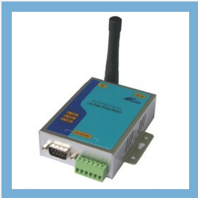
ATC-871 Serial Converter