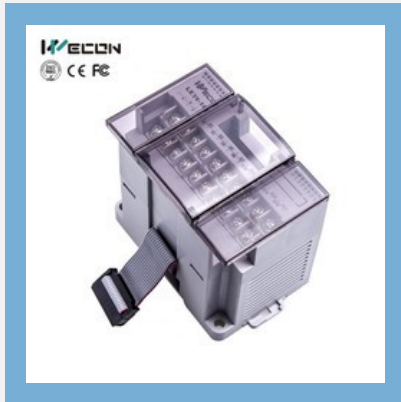
LX3V-16EX Programmable Logic Controller