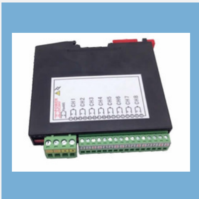
KH-7018 Khoat 8 Channel Isolated Input Module