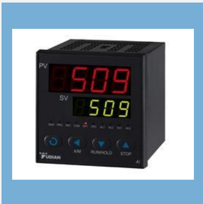
Yudian AI 509 PID Temperature Controller