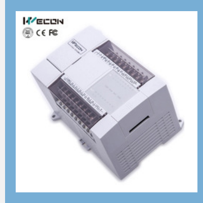
Wecon PLC LX3V Series