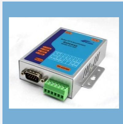
ATC 3001 RS232 Converter