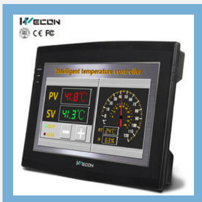
Wecon HMI 10.2 Inch Levi-102EL- Standard