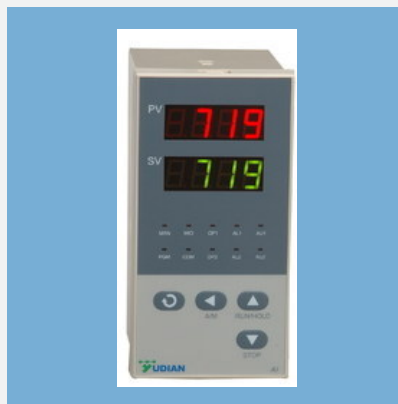
AI-719 Process Controller