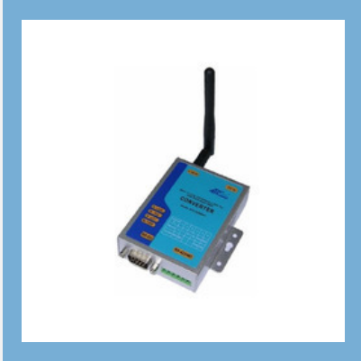
ATC-2000WF Wireless To Serial Converter