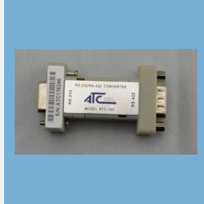
ATC-101 RS 232 to RS 422 Converter