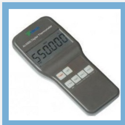
Hand Held Thermometer