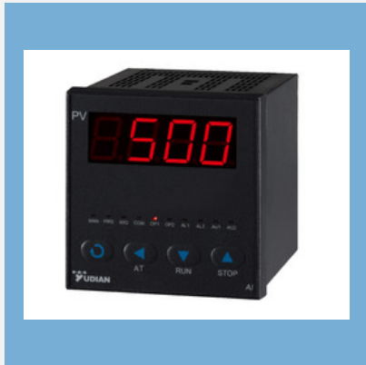
Yudian Universal Indicator AI-500