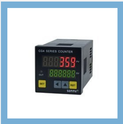
Mtec Timer HG Series Digital Timer