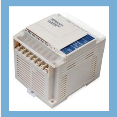
Wecon PLC LX3V Series