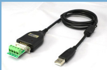
ATC-810 USB TO Serial Converter