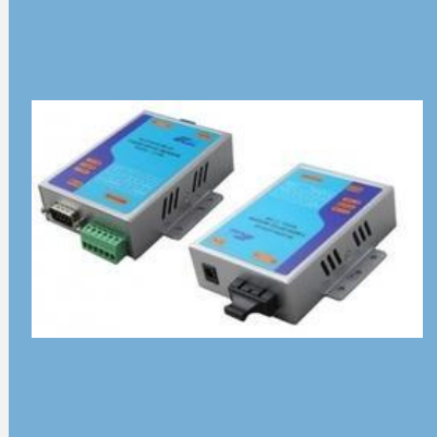
ATC277 SM Multi Mode Fiber Optic Converter / Modem