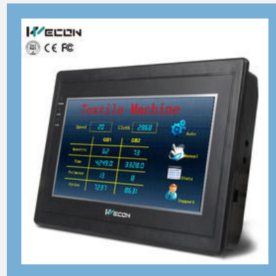
LEVI-700E Wecon HMI 7 Inch