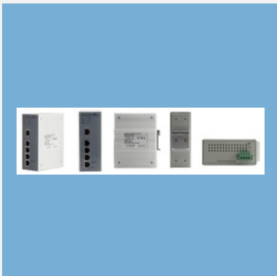
ATC-405 5-Port Manage / Unmanaged Ethernet Switch