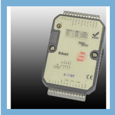
A-1189 Yotta Control DCS