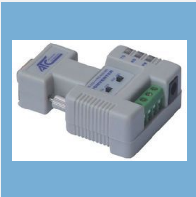
ATC 105 Serial Interface Converter