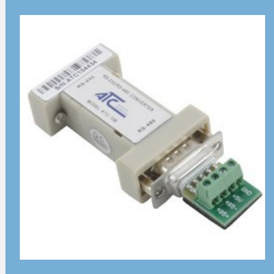
ATC-106 RS 232 To RS 485 Interface Converter