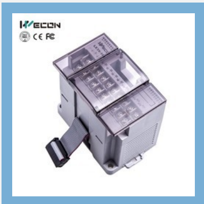
LX3V-1WT Programmable Logic Controller