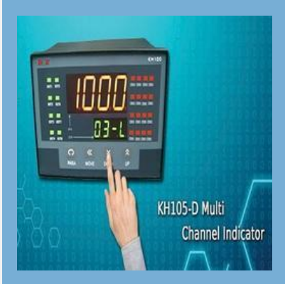
Khoat Multi Channel Indicator KH-105D