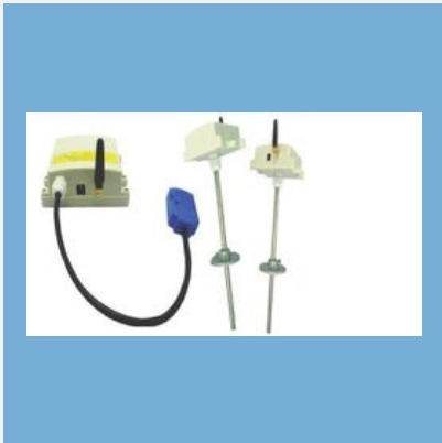
Khoat Make Temperature and Humidity Transmitter 706TG