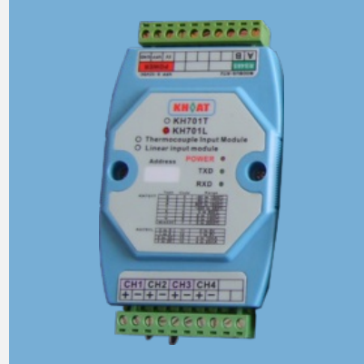
KHOAT KH 701R S 8 Relay SSR Output Module