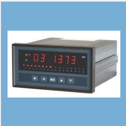
Multi Channel Temperature Indicator / Scanner