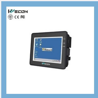
Wecon HMI Levi-350T 3.5 inch Touch Screen