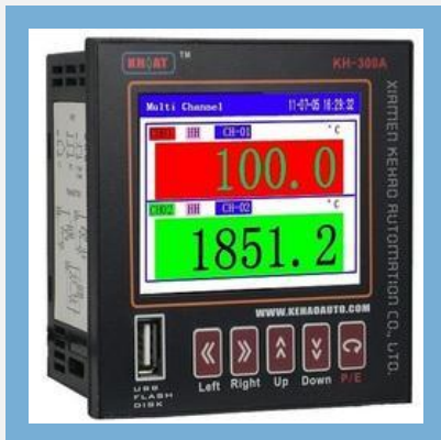
KH300AG Intelligent Mini Color Paperless Recorder