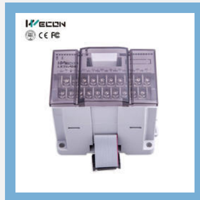
LX3V-4DA Programmable Logic Controller