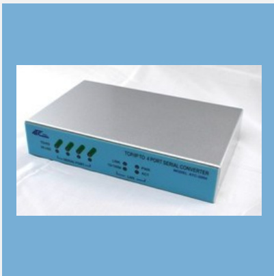
ATC 2004 TCP-IP Converter