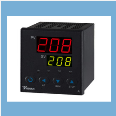
AI-208 Yudian Low Cost PID Temperature Controller