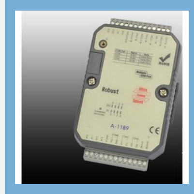
A-1188 Yotta Control DCS