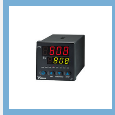
AI-808H Flow Totalizer