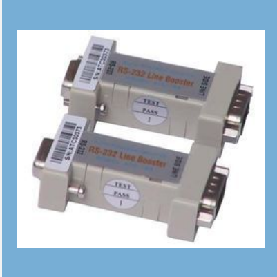
ATC 155 Port Powered RS-232 Isolator