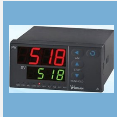
Yudian Make Universal PID Controller AI-518