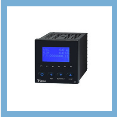
Yudian AI-708H Flow Totalizer / Flow Indicator