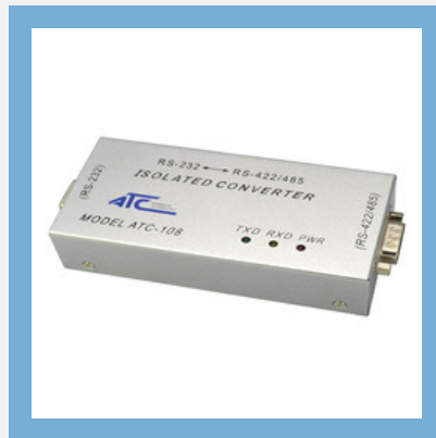
ATC-108 Port Powered RS-232 Isolator