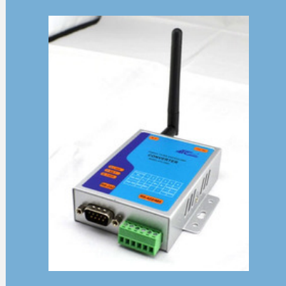
ATC 3200 Serial Converter