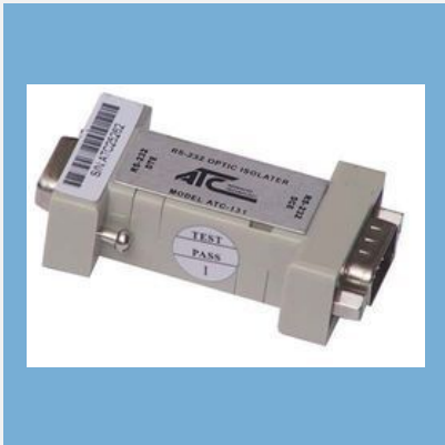
ATC 131 Port Powered RS-232 Isolator