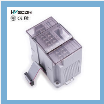
LX3V-4TC Programmable Logic Controller