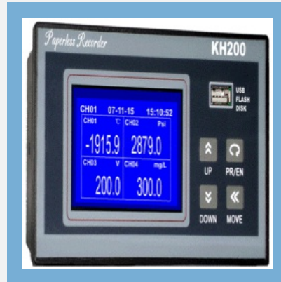
KH200B-D Economic Blue Paperless Recorder