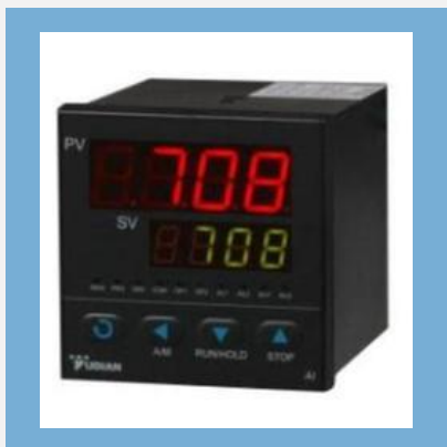
Yudian AI-708/808 PID Advance Controller