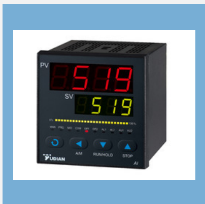
AI-519 Process Controller