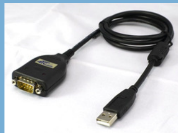
ATC-820 USB To Serial Converter