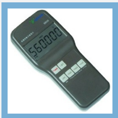
High Precision Thermometer