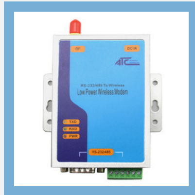
ATC-873 Serial Port Converter