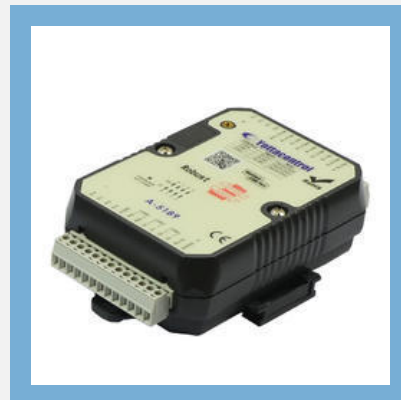
Yotta A Series Remote IO Modules