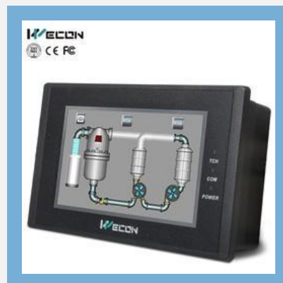
Wecon HMI 4.3 Inch-LEVI-430T-Standard