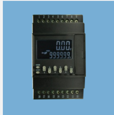
TC-Pro482 Series Timer