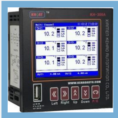
KH300AB Mini Blue Paperless Recorder