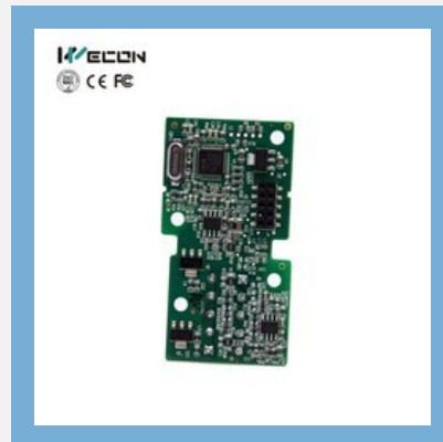
Wecon LX3V-2AD2DA-BD PLC Module