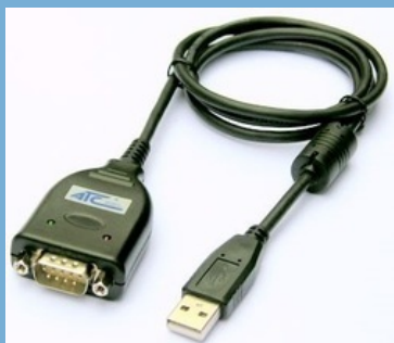
ATC-830 USB TO Serial Converter