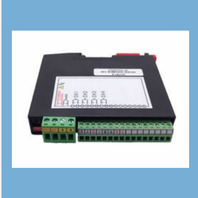
KH-7014 Khoat 4 Channel Isolated Input Module